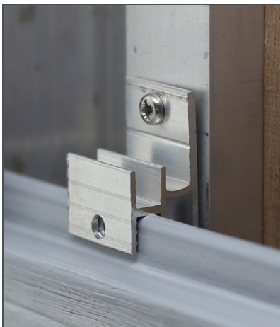
AW08 fasteners secure the US09 boards as a tongue-and-groove system

The tongued board, US09 , is secured with 6063 aluminum clips, which act as the groove in the system. Also available are outside corner trim, inside corner trim, butt joint trim, and end cap trim pieces—all made with the encased composite material, see Accessories/Options for the item numbers and sizes. See images for fastener, fascia and all accessories' installation examples.