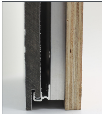
AW2 track secures the US09 boards on the lower perimeter

Width × depth × length: 5½ × ½ inches × 16 feet. (142 × 13 mm × 4.87 m)