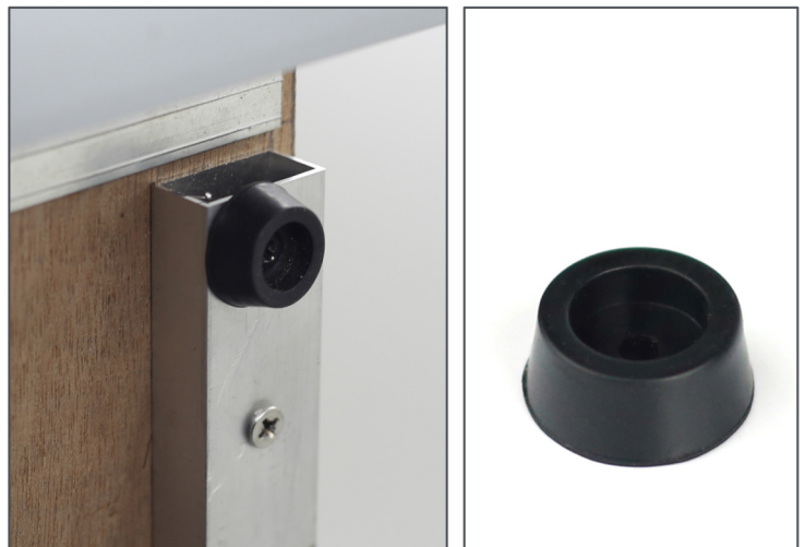
T-7 end plugs support the last US09 boards