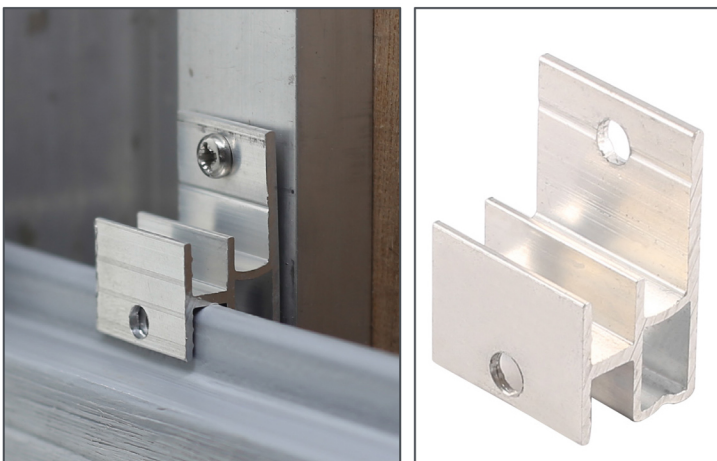
AW08 fasteners secure the US09 boards as a tongue-and-groove system

The tongued board, US09 , is secured with 6063 aluminum clips, which act as the groove in the system. Also available are outside corner trim, inside corner trim, butt joint trim, and end cap trim pieces—all made with the encased composite material, see Accessories/Options for the item numbers and sizes. See images for fastener, fascia and all accessories' installation examples.